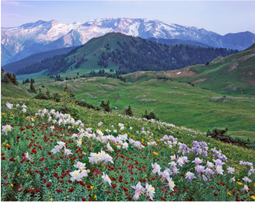
Treasure Mountain, one of the proposed Hidden Gems Wilderness Areas