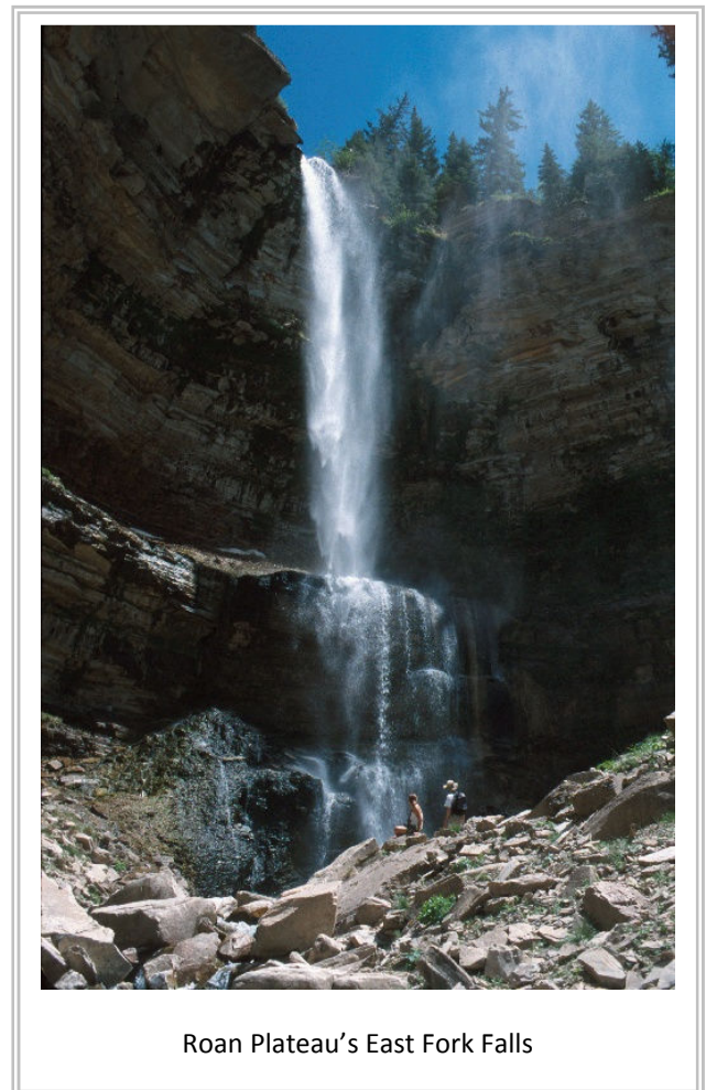
Roan Plateau's East Fork Falls

The Board is the governing body of the CMC, a Colorado non-profit corporation with tax exempt status under section 501(c)(3) of the Internal Revenue Code. As the governing board, under state law it is solely responsible for the management of the business and legal affairs of the CMC. The implementation responsibility of Board-adopted policy lies with the Executive Director, the Chief Executive Officer of the Club. The Board has four officers (all from Denver) and 15 other directors from at least seven different groups. Currently the Board of Directors consists of four Denver Group members, two Boulder Group members, two Fort Collins Group members, two Pikes Peak Group (Colorado Springs) members, one Gore Range Group member, one Aspen Group member, one Sneffels Group member, one Weld County Group member and one Colorado Wilderness Kids Group member. The Board is elected by the State Council, with 1/3 of the 15 non-officer positions elected each fall for three-year term. The State Council has a representative from each of the 15 groups, representatives from five state committees, and Board members