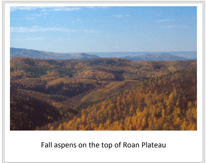
Fall aspens on the top of Roan Plateau

The CMC is not alone on this. Beyond the ten local, state and national organizations who signed on to the lawsuit, on Wednesday, July 30th, the state of Colorado joined in formally protesting the upcoming leasing of the Roan Plateau. The State Department of Natural Resources (DNR) filed a protest reiterating Governor Bill Ritter’s desire to see the plateau leased in phases rather than all at once — an idea the BLM has rejected. The Colorado Division of Wildlife, which is part of the DNR, also submitted a separate protest. In solidarity, U.S. Representatives John Salazar and Mark Udall and U.S. Senator Ken Salazar also have formally protested the leasing of the Roan.